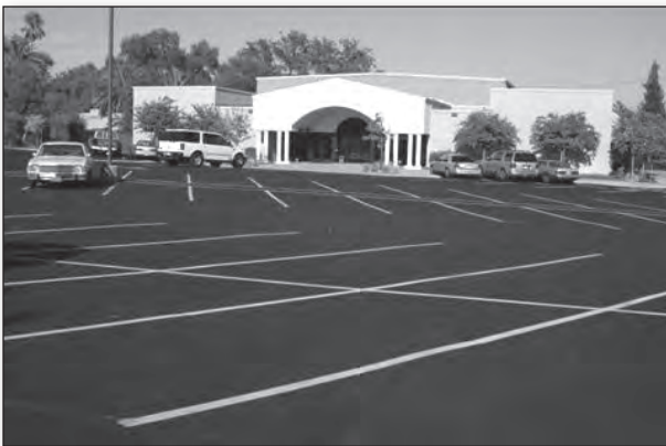
Recent Facility Improvements: Parking Lot Sealing and Striping Heating & Air Conditioning Repairs