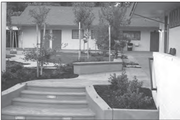
The Sister Arlene Connelly Prayer Garden

All this has been accomplished while the school has continued to receive only a modest subsidy from the parish at previous years’ levels. In total, the school is no real financial cost to the parish but contributes greatly in a variety of ways.